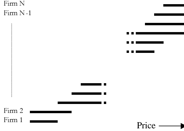
Figure 2: Price Supports

Now consider the “head-to-head” competition that occurs at some given price p . If p is offered in equilibrium, it is offered by a consecutive set of firms l, \dots, m . Each of these firms must be just indifferent to changing its offer slightly away from p . So for each n = l, \dots, m ,